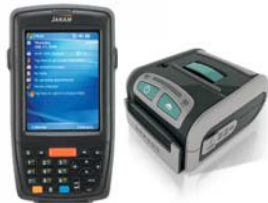
JANAM XM65 AND DATECS DPP250 PRINTER