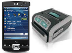
HP IPAQ 212 AND DATECS DPP250 PRINTER